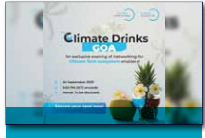
Climate Drinks Goa 24th September, Panaji