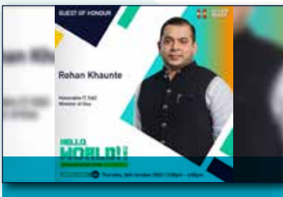
Hello World Global Technology Summit 26th October