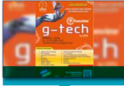
g-tech by CDFG at Institute Menezes Braganza Hall 06th-07th October, Panaji

For up-to-date information on events, SCAN THE QR CODE