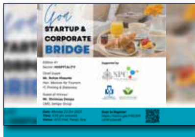
Goa Startup & Corporate Bridge at GCCI. 23rd October, Panaji