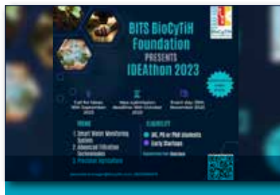
IDEAthon 2023 by BITS BioCyTiH Foundation 25th November