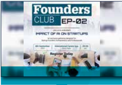
Founders Club episode 2 on impact of AI on startups at International centre Goa 08th September, Dona Paula